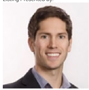
Originally Listed by: Real Broker B.C. Ltd.