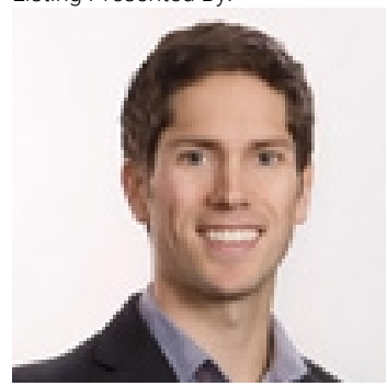
Originally Listed by: RE/MAX Kelowna - Stone Sisters