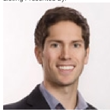
Originally Listed by: RE/MAX Realty Solutions