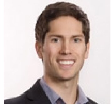
Originally Listed by: RE/MAX Grande Prairie