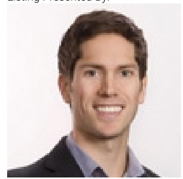
Originally Listed by: RE/MAX Bulkley Valley