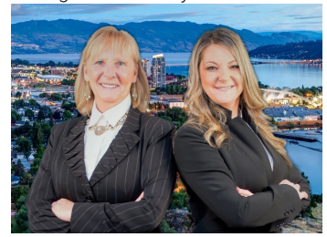
Originally Listed by: Royal LePage Aspire Realty